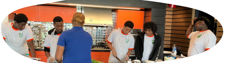
Teen Cooking Program, Raleigh Library